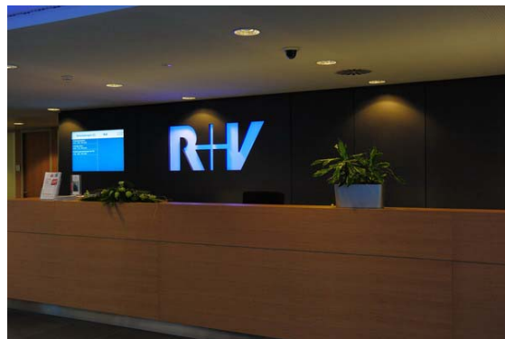
The building-high entrance hall with foyer (photos left and top right).